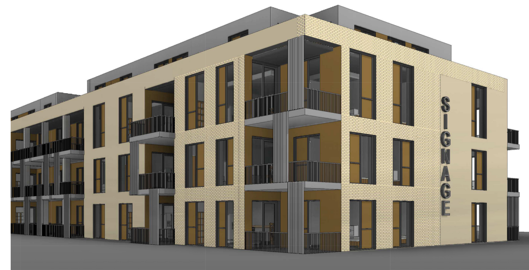
3 3D View.